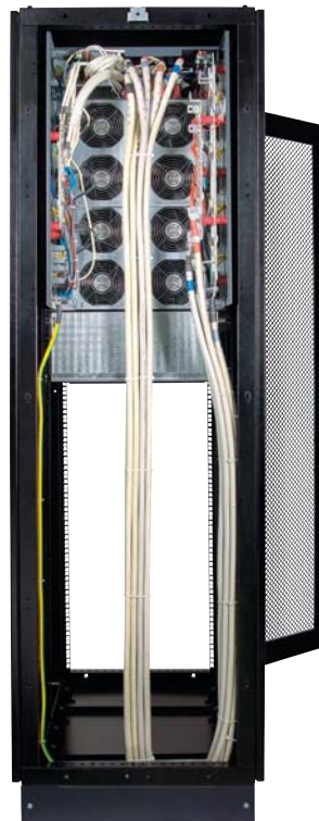
Rear view (before adding rear protective cover). Flexible cabling management for easy connections and tidier cabling.