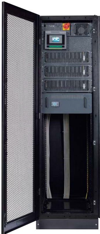
Example of integration (3x25 kW). Only 15 U of rack space occupied: space-saving design leaving free space for other rack-mounted devices. One empty slot in the MODULYS RM GP sub-rack remains available for power upgrade or redundancy.